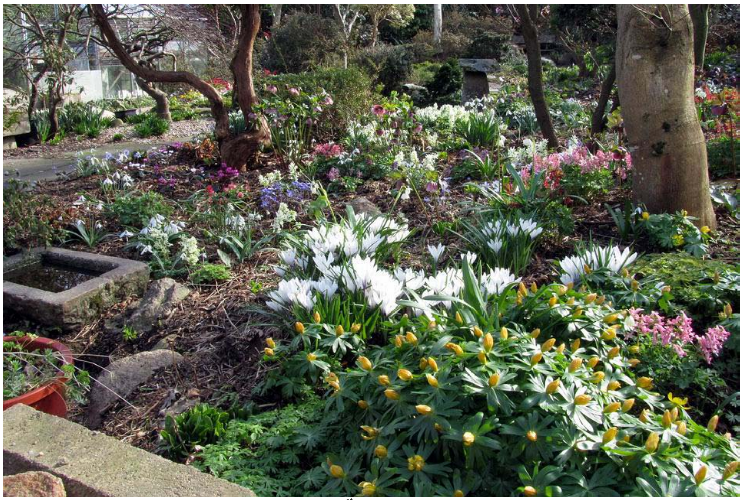
Spring seems to have arrived as I write on Monday 21st March: we are basking in lovely warm sunshine which pushes the temperature up to 17C encouraging a most magnificent display of colour. This mass planting of mixed