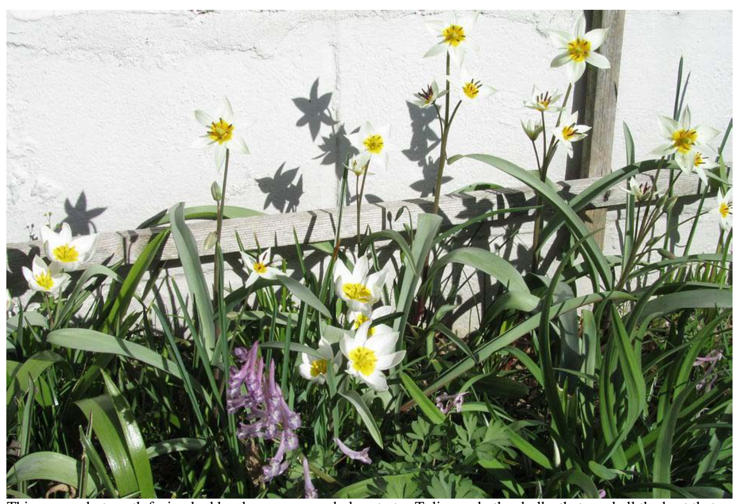
This narrow hot south facing bed has become a good place to try Tulips and other bulbs that need all the heat that we can give them this far north to ripen the flower buds. Tulipa polychroma and Tulipa turkestanica are seen here.

Narcissus cyclamineus is another perfectly hardy bulb that I grow in the garden and also in frames where I regularly raise them from seed which produces an interesting range of corona shapes.