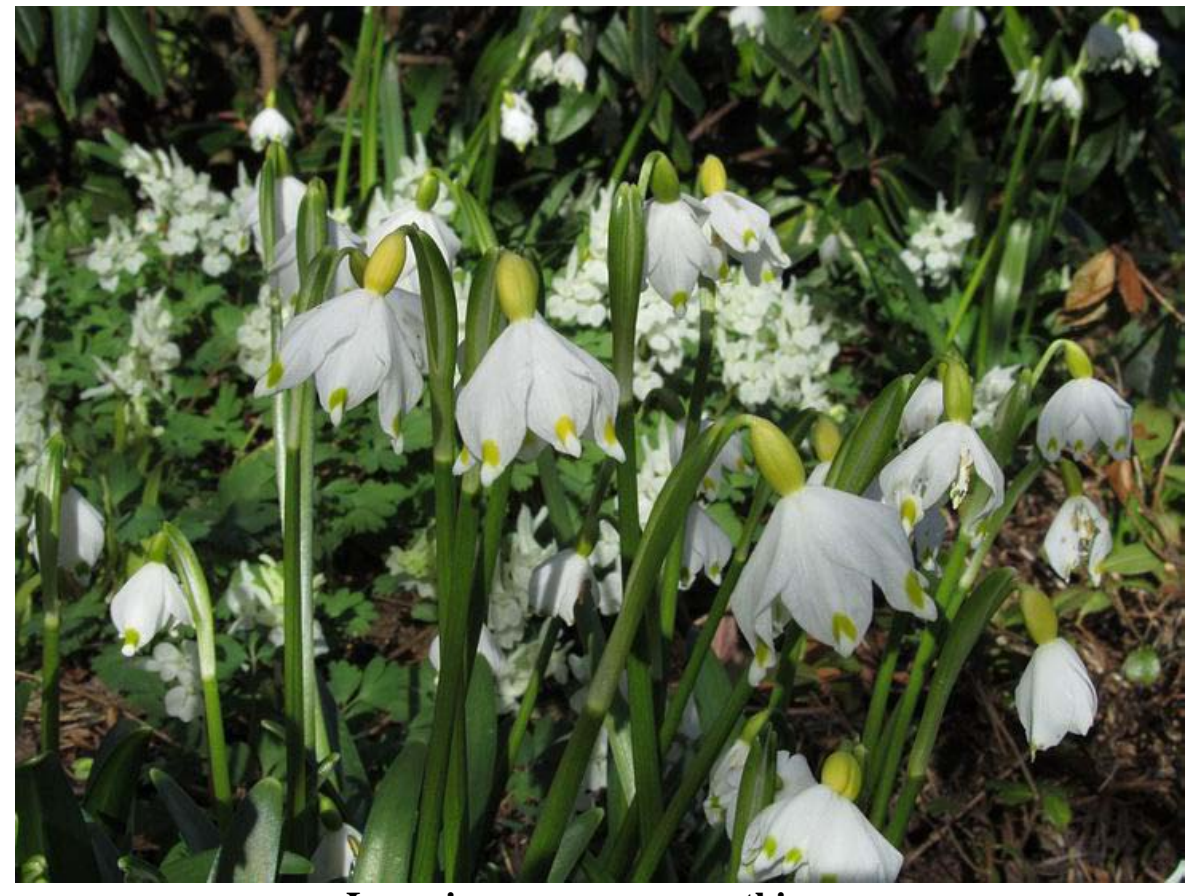
Leucojum vernum carpathicum

Another variation of Leucojum vernum carpathicum similar to the one above but this time the ovaries are also always yellow. Look carefully and you will see that the degree of yellow on the tips can vary some are more yellow and some are close to green. You can even find flowers that have green tips on one side and yellow tips on the other. Obviously the growing conditions, especially light levels and temperatures have an effect on the colour of the tips.