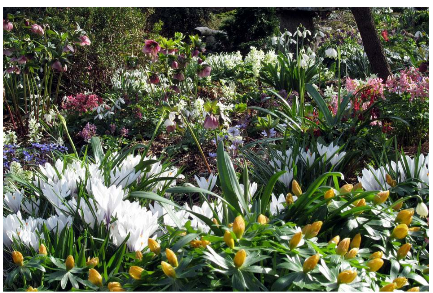
I will leave you with another picture of what spring can look like in Aberdeen - if only it would come and stay when it arrives without the threat of winter returning again next week.