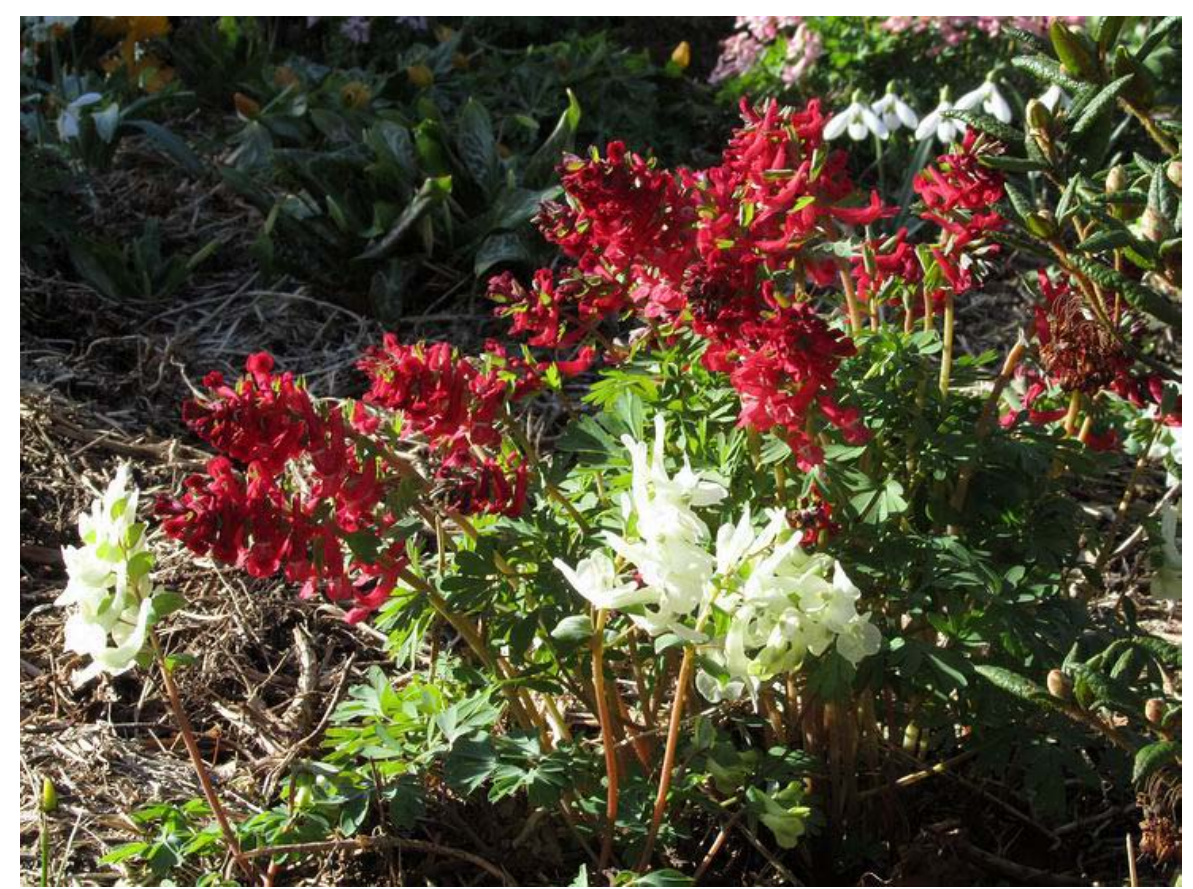
Corydalis 'Craigton Red' and C. malkensis

Also try to resist falling into the trap of planting it in a pot and keeping it in an alpine house as it is much happier in the garden. It seems that the more expensive and rare a plant is the more we are inclined to grow it in a pot – to look after it better! Then, worried about losing it, we usually starve it of sufficient water and nutrients just when it wants to grow resulting in the bulb getting smaller each year. I find that so often the best thing we can do with these expensive plants is to stick them in the garden where they can look after themselves much better than we can. This is certainly the case with Corydalis ornata.