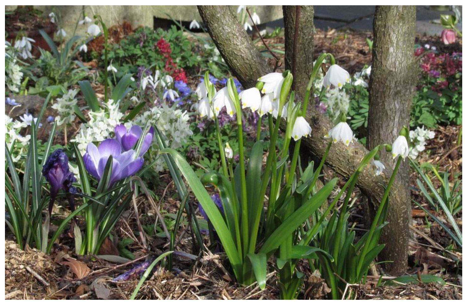
Leucojum vernum carpathicum

It is my aim to get a lot more bulbs out of pots and into the garden and this pot of Crocus veluchensis is among those. It is a fabulous colour and a great garden plant that I have often admired planted along with the hot coloured Corydalis in the long bed next to the Bulb frames at Gothenburg Botanic Gardens.