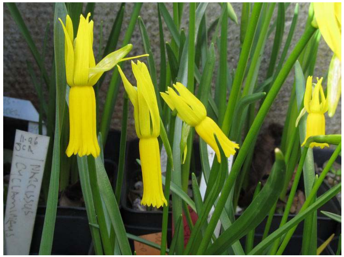
Narcissus cyclamineus seedlings

Narcissus cyclamineus is another perfectly hardy bulb that I grow in the garden and also in frames where I regularly raise them from seed which produces an interesting range of corona shapes.