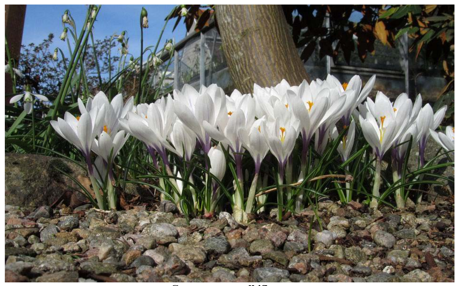
Crocus vernus albiflorus

This is a garden seedling that took my eye many years ago and remains one of my favourite crocus for the garden. It has an elegant shape with the colour of the violet tube just extending up the pure white floral segments.