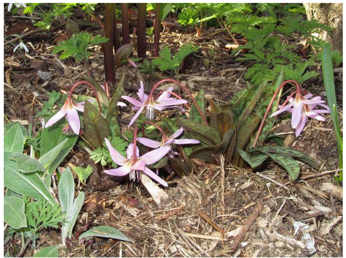
Erythronium dens canis