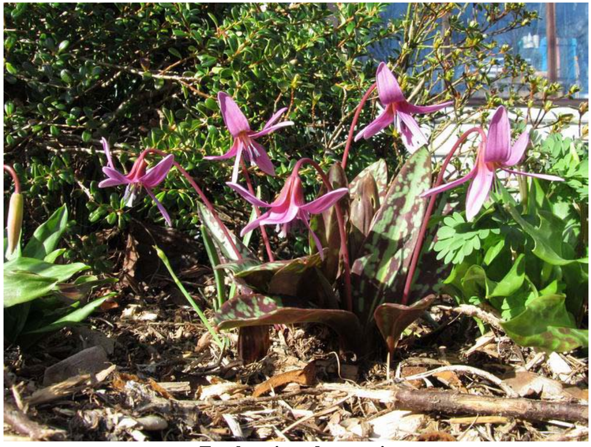
Erythronium dens canis

The first clumps of Erythronium dens canis are opening their flowers, as you can see. This is the darkest colour form we have and below is a paler form.