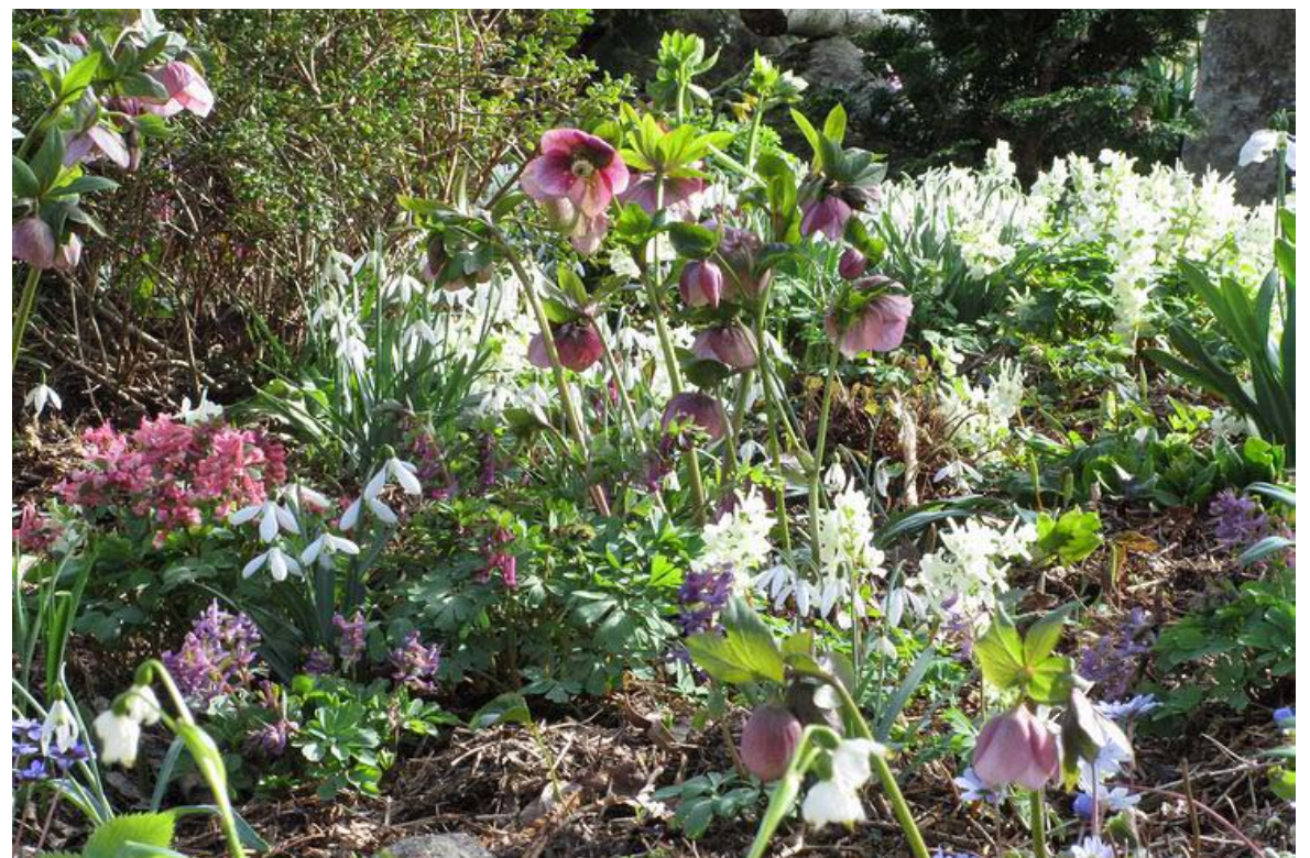
bulbs is exactly what I am trying to achieve all over the garden and on top of that I want this effect to be ever changing so another group of bulbs will take over as the ones in these pictures start to fade and go dormant - this is what I call my 'High Rise and Time Share' gardening.